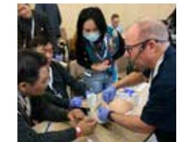
HANDS-ON INJECTION SIMULATOR*