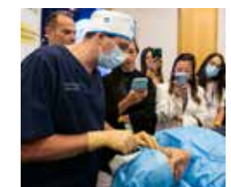
LIVE PATIENT TREATMENTS