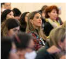
VIDEO ANATOMY PLENARY