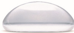
NATRELLE INSPIRA Breast Implant