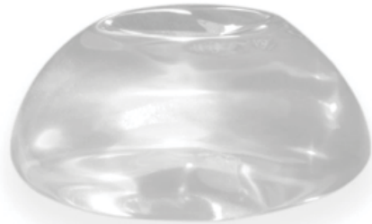
NATRELLE TruForm® 1 Breast Implant